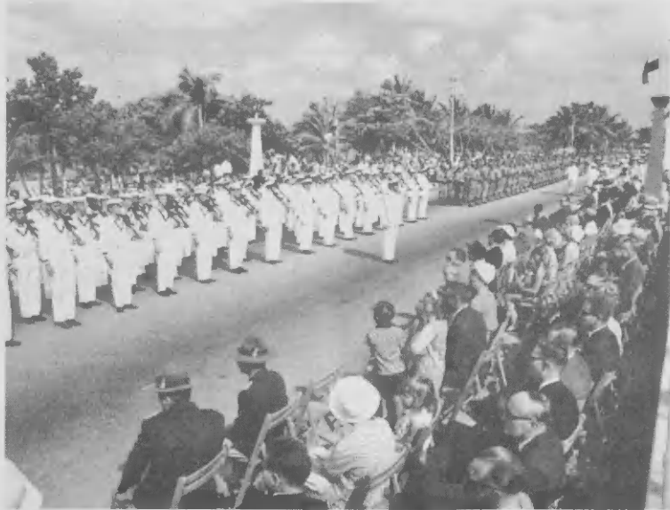
Dutch Marines - Mariniers Hulandes